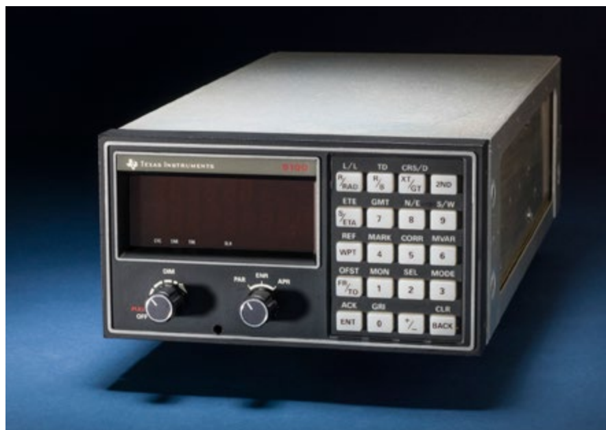
A LORAN-C receiver, circa 1980, is only one of the old tools we’re not using anymore. LORAN-C offered mariners better precision than its predecessors, but it was still imprecise beyond half a mile.

It is probably a bit ironic that one of the most reliable tools we have in our pilot house is also the least used and most neglected: the magnetic compass. A needle thrust through a straw and floated in a