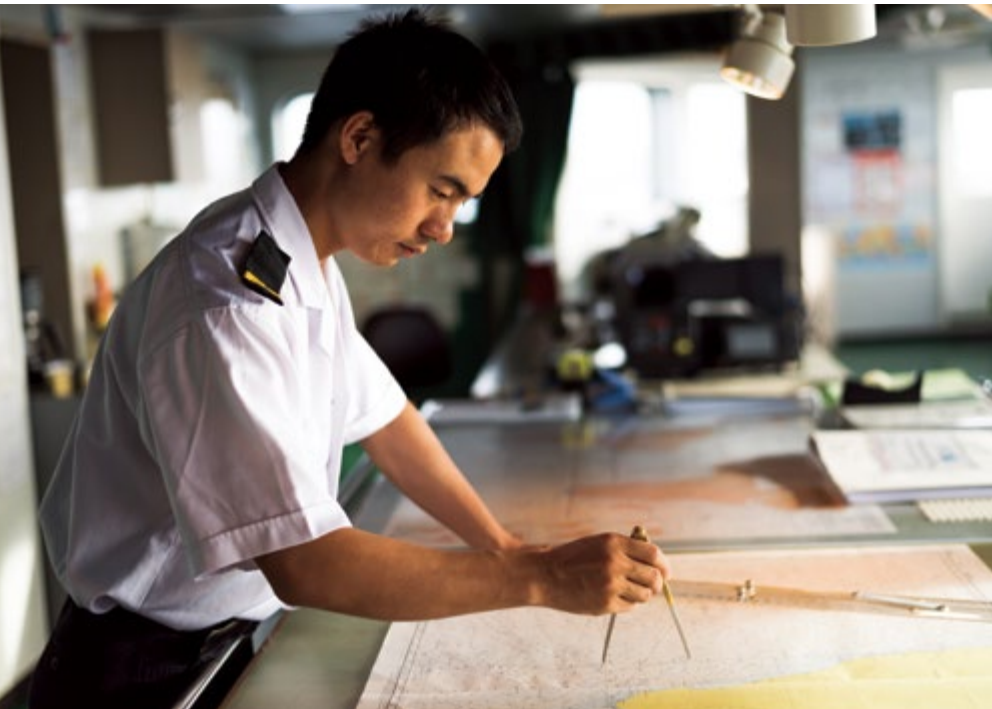
Paper charts are still commonplace for both professional and recreational mariners.

container of water is what describes the earliest “known” compass. When the magnetic compass was first used is unknown and there is very little to substantiate where it came from, although it’s widely believed that the Chinese developed it around 1,000 A.D. Today, the magnetic compass is our only non-electronic instrument to maintain directional orientation and remains the one instrument you can rely on when all else fails.